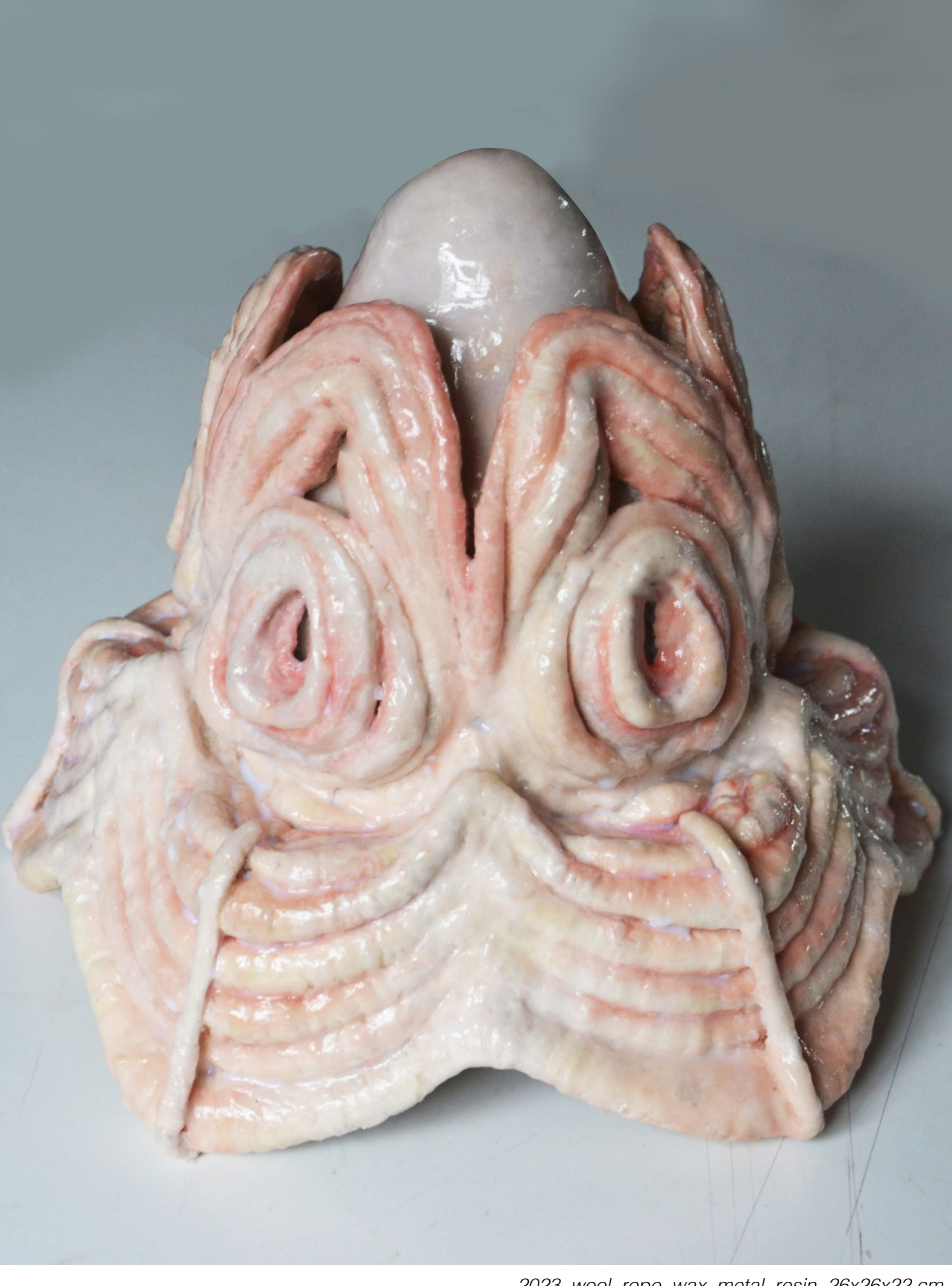
2023, wool, rope, wax, metal, resin, 26x26x22 cm