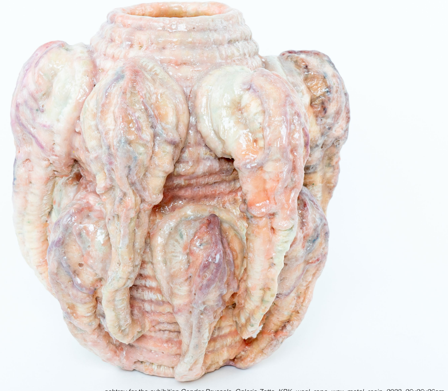
ashtray for the exhibition Cendar Brussels, Galerie Zotto, KBK, wool, rope, wax, metal, resin, 2022, 26x26x26cm