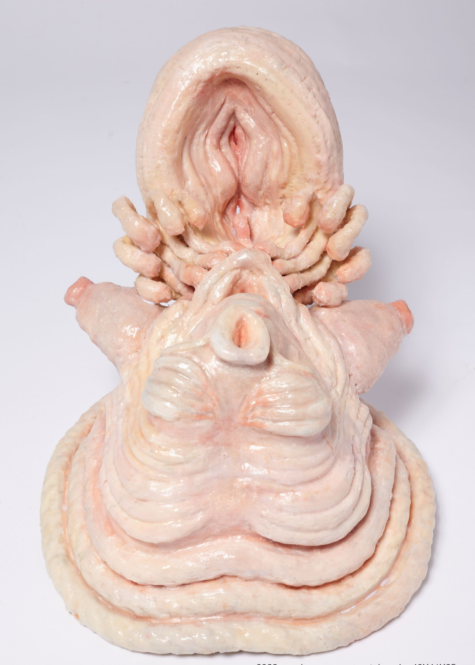
2023, wool, rope, wax, metal, resin, 40X41X25 cm