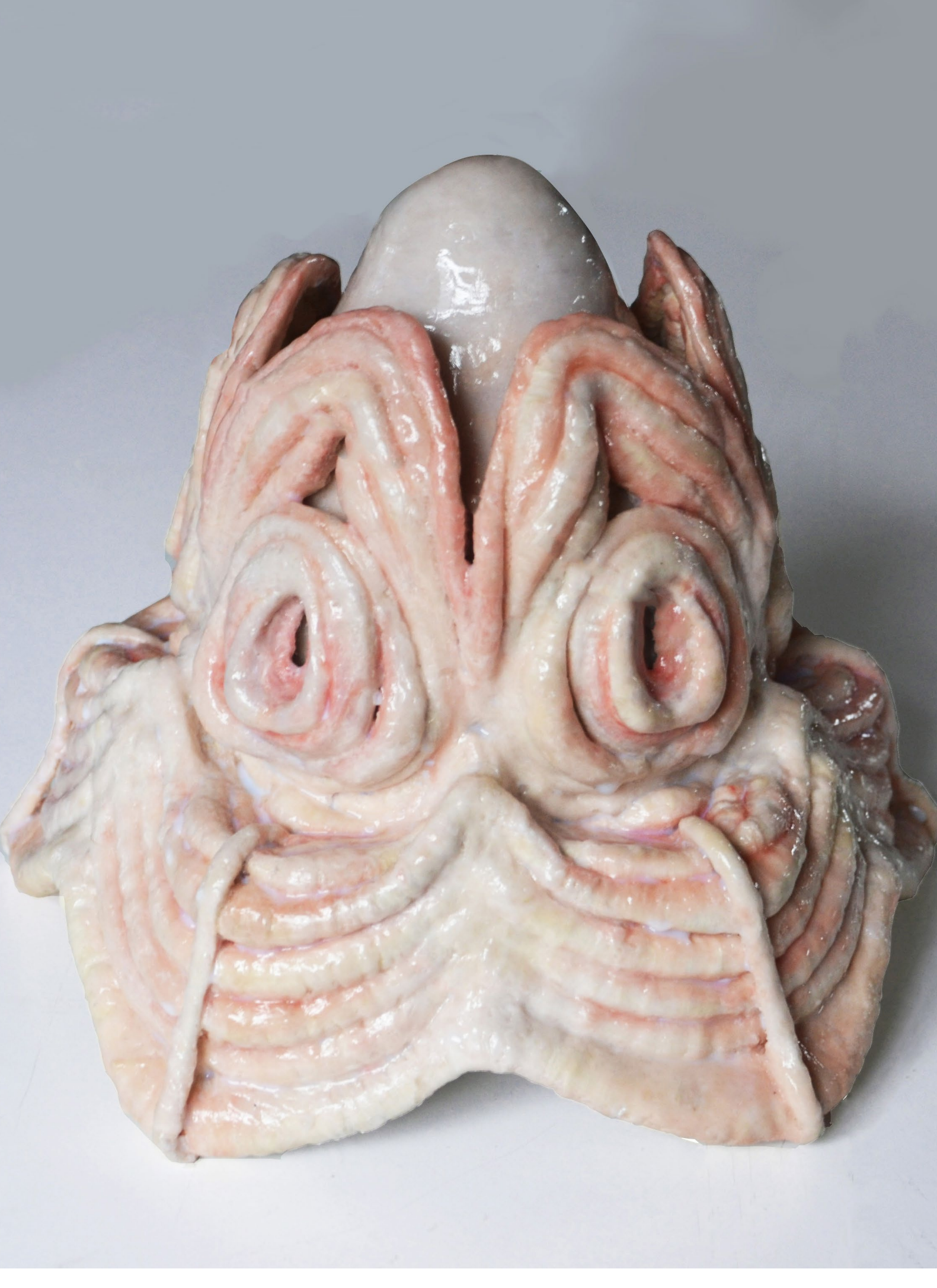
ovoviviparous, wool, rope, wax, metal, bio resin, 22x22x23 cm, 2024