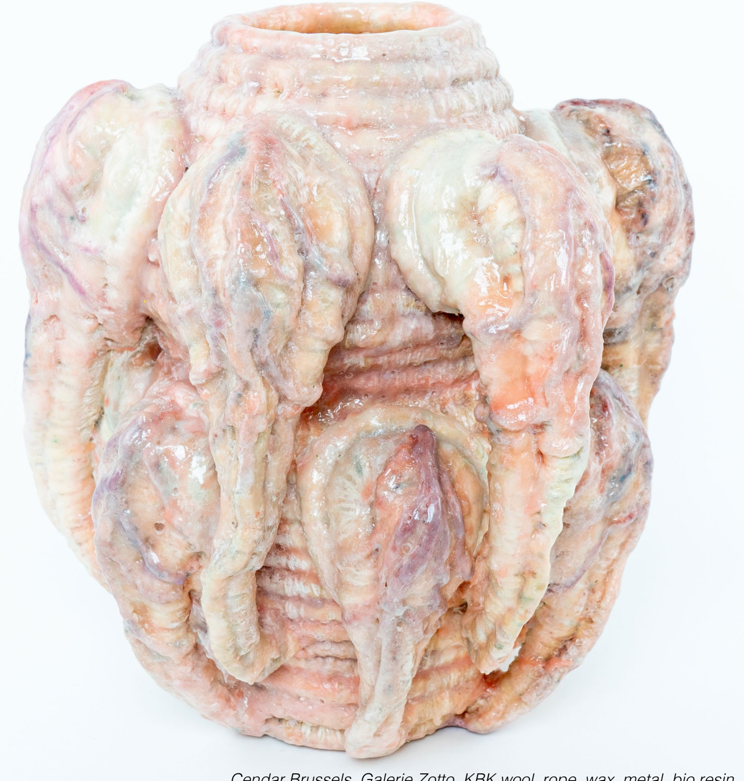
Cendar Brussels, Galerie Zotto, KBK, wool, rope, wax, metal, bio resin, 2022, 26x26x26cm