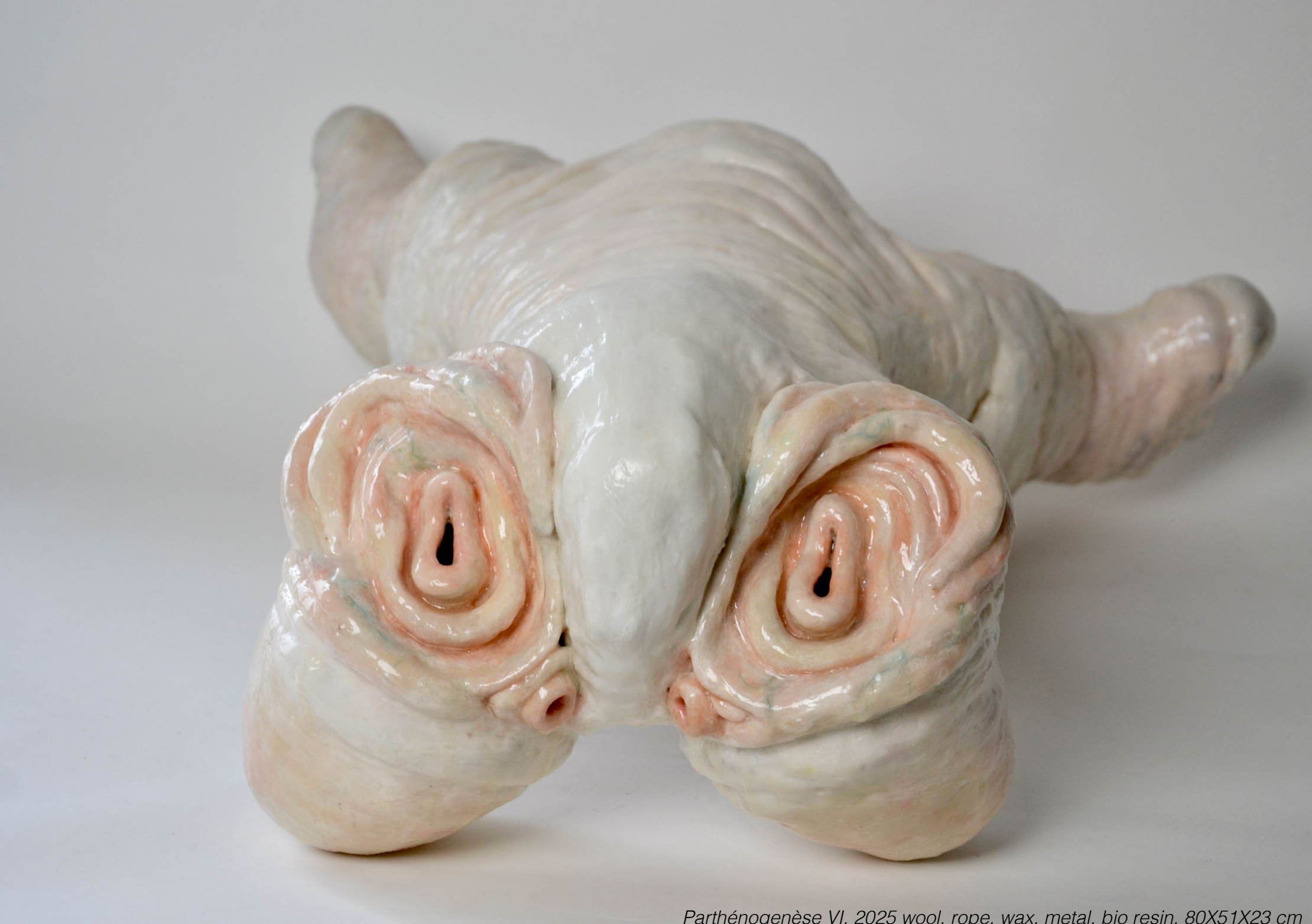
Parthénogenèse VI, 2025 wool, rope, wax, metal, bio resin, 80X51X23 cm