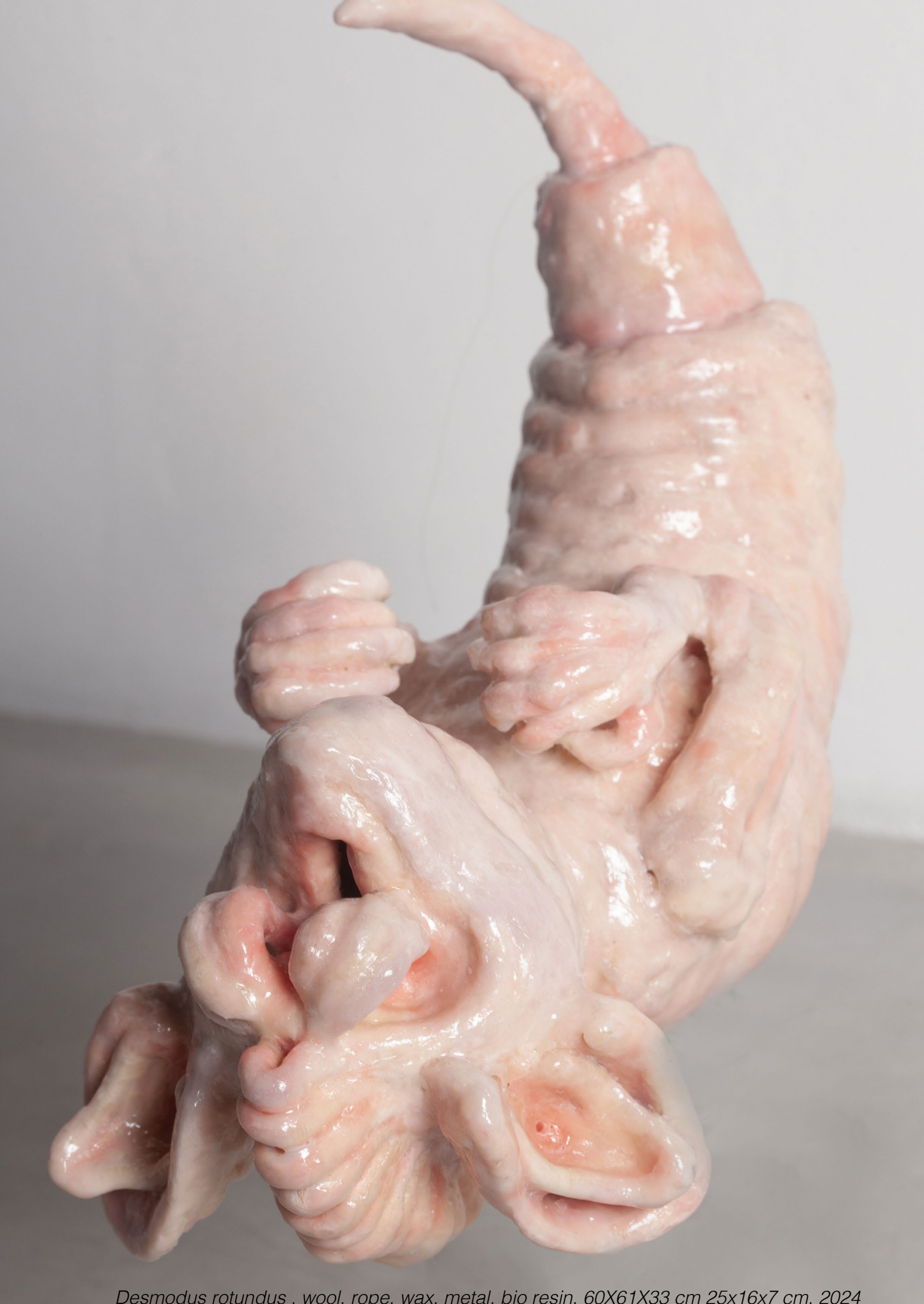
Desmodus rotundus, wool, rope, wax, metal, bio resin, 60X61X33 cm 25x16x7 cm, 2024