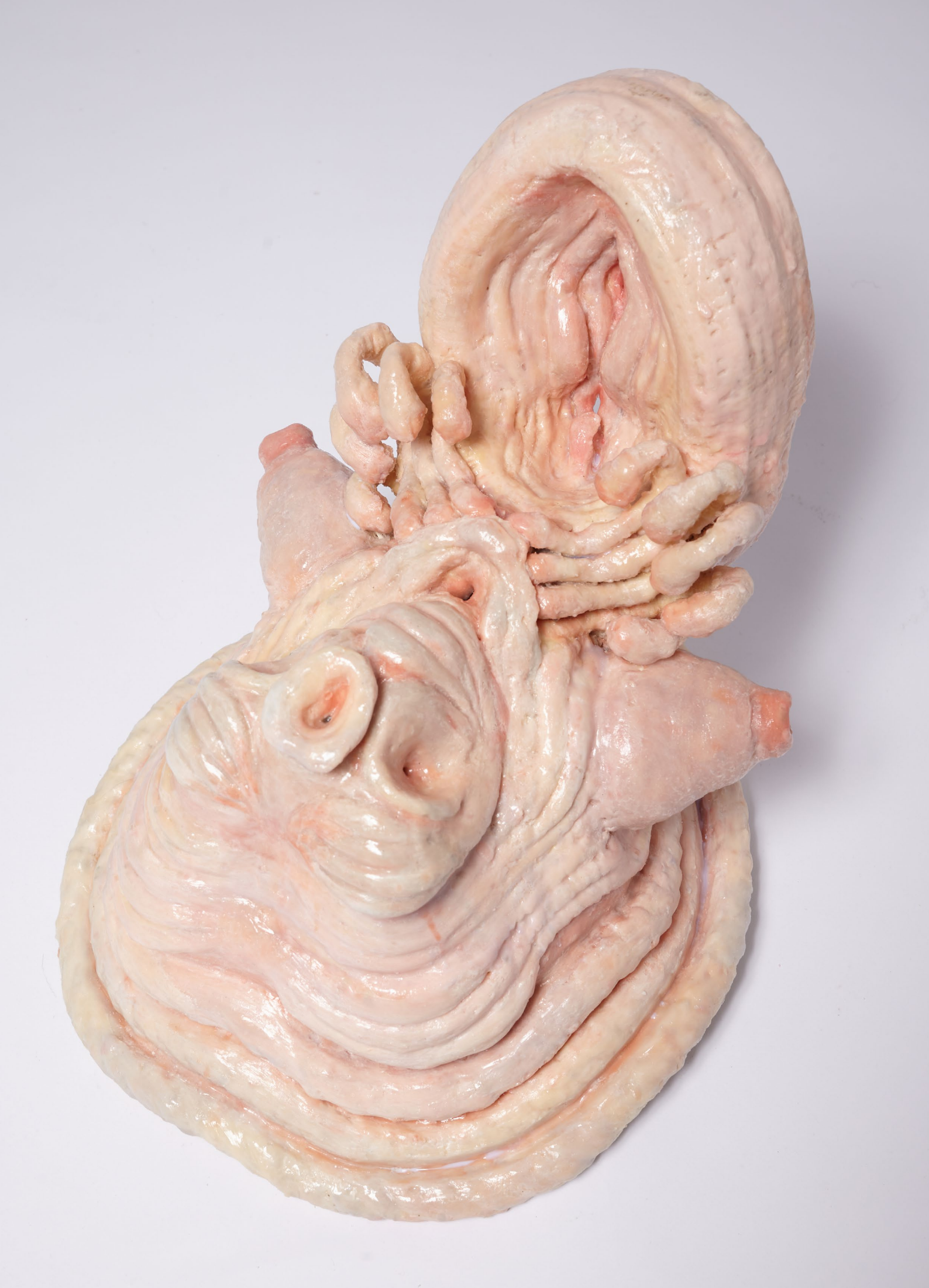
Parthénogenèse IV, wool, rope, wax, metal, bio resin, 40X32X33 cm